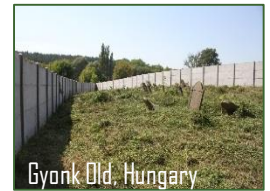
Gyonk Old, Hungary