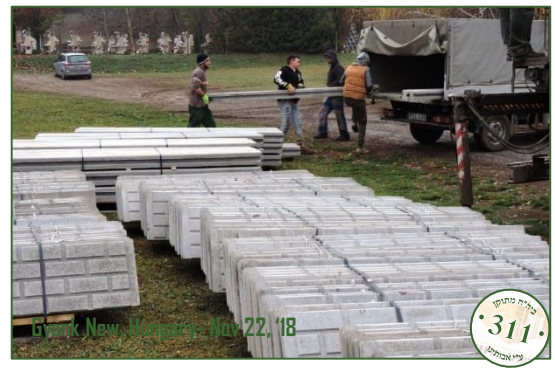
Gyonk New, Hungary, Nov. 22, '18

Gyonk Old - Family members prepare for the next phase of cemetery restoration: repair tombstones and redirect the water flow. It is expected that the government will give a partial grant for the work.