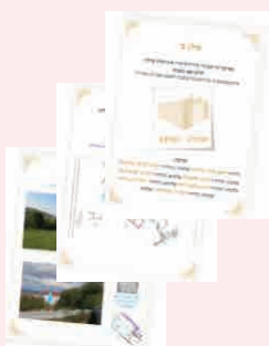
Presentation shown to family members