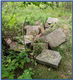
Neglected gravestones lying around