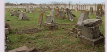
Part of the remaining 250 gravestones in terrible, neglected condition