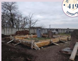
Picture of the new foundation poured on the original foundations