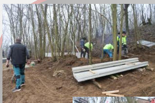
Ongoing heavy work, as they're building the fence