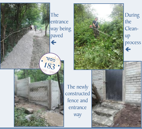
The entrance way being paved