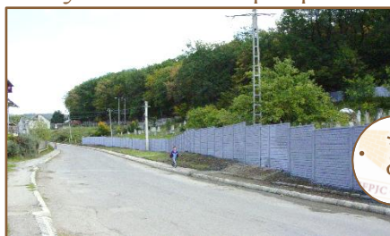
2003: Beautiful fence constructed

Family members will repair part of the fence that has been weakened during construction of a nearby city highway