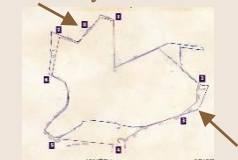
Final negotiations continuing to enable completion of fence

Sketch of the cemetery Fence completed in these days