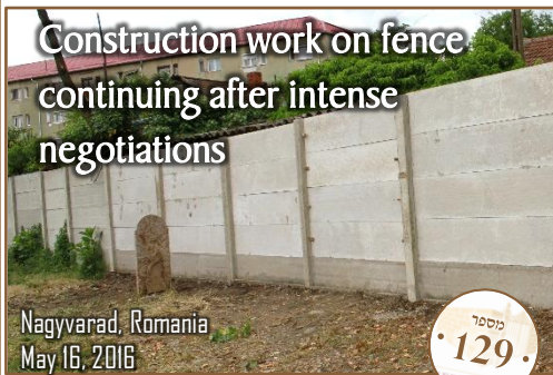
Construction work on fence continuing after intense negotiations