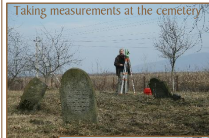
Taking measurements at the cemetery