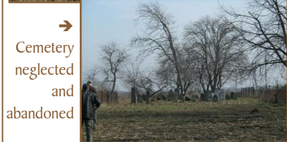
Cemetery neglected and abandoned

Their son-in-law R' Yechezkel Brach Shlit"a