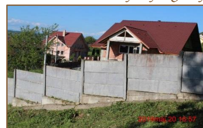
Fence impaired from nearby construction