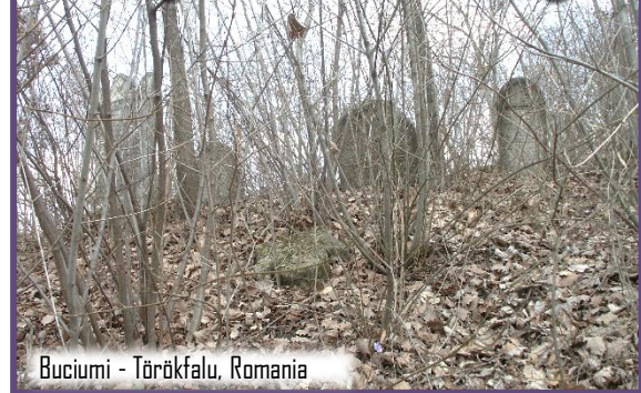
Buciumi - Törökfalú, Romania