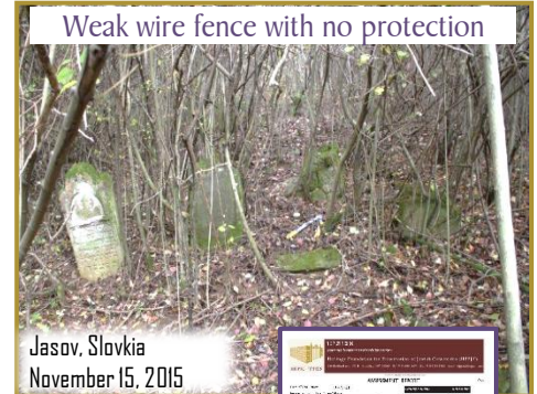
Jasov, Slovakia November 15, 2015

Detailed report of the cemetery's condition