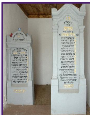
Gravestones of the Tzaddikim, Rabbonim of Kemece