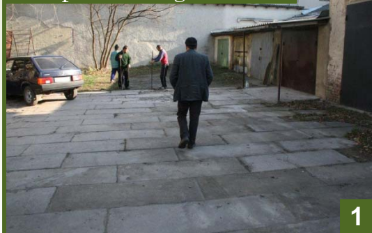
Road paved with gravestones

1942 – Kolomaya'r Jewish cemetery developed into a park. Gravestones utilized by Gestapo to pave a street. 2006-2009 – HFPJC invests tireless intervention to enclose the sacred site. Beautiful and durable enclosure constructed.