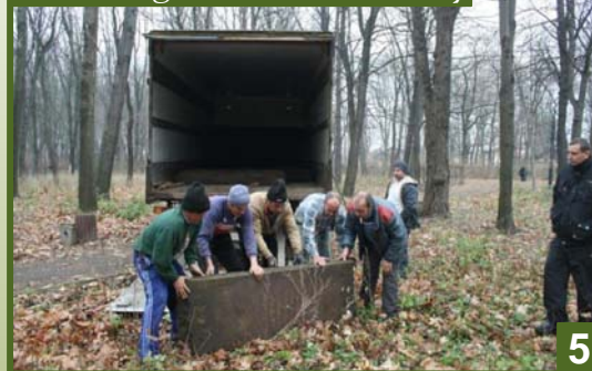
Unloading a stone in cemetery

November 2010 – The extracted gravestones are loaded and delivered by truck to cemetery site. Street immediately repaved to enable pedestrian pathway.