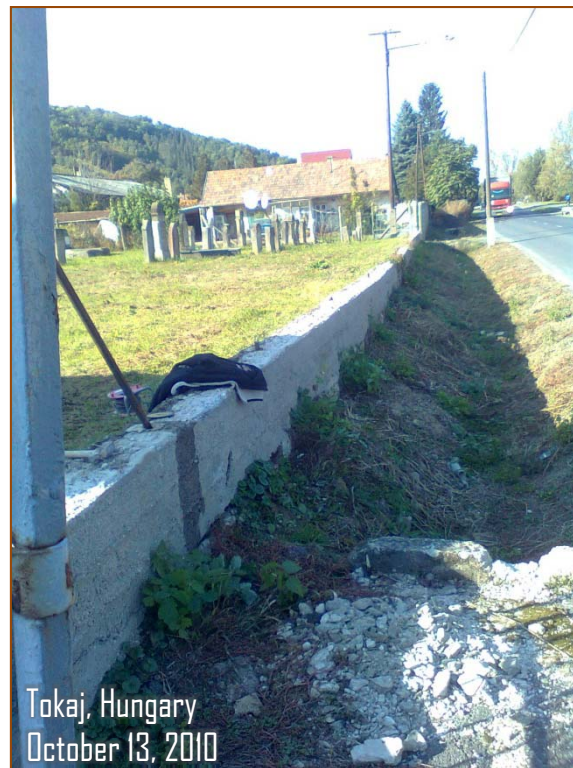
Tokaj, Hungary October 13, 2010