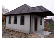
Radvil, Ukraine The אוהל of Hagoan R' Yitzchok of Radvil זי"ע, built by Avoyseinu, sponsored by his grandson