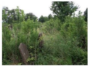
Cemetery in a dreadfully neglected condition

The Admo'r of Radvil Shlit'a Boro Park/his brothers the Rabbonim of Radvil and Brod Syhlit'a' The Rav of Brody Shli'a