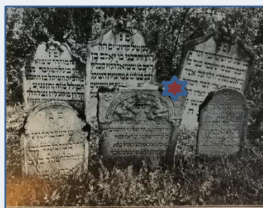
← Photo of the original tombstone of the holy Machtzis Hashekel and his son and his grandson זי"ע (the tombstone with the symbol, in front of the Machtzis Hashekel's son, shows the exact location of their resting places)